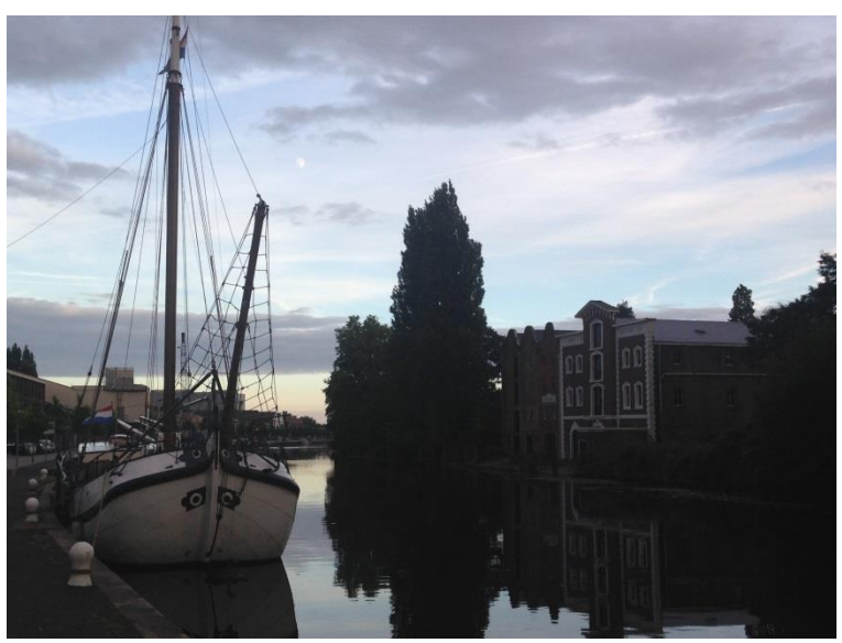
(Here is a view on the backyard from my room. There was a small channel with several cute boats as you can see on the photo)

I did not get any feeling that I was staying in some suburb. I did not meet any obstacles to find my way around. I could easily ask people in the streets to help me. As for me the Dutch language is the mixture of the English and the German language with its own pronunciation and phonetics. If you can speak English, you will not get lost in the new surroundings. The signs and marks in the streets, in public transport, restaurants and cafes were not complicated to understand to get an idea what this or that word means.