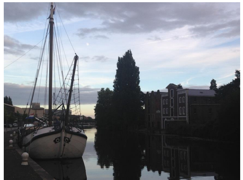
(Here is a view on the backyard from my room. There was a small channel with several cute boats as you can see on the photo)

I did not get any feeling that I was staying in some suburb. I did not meet any obstacles to find my way around. I could easily ask people in the streets to help me. As for me the Dutch language is the mixture of the English and the German language with its own pronunciation and phonetics. If you can speak English, you will not get lost in the new surroundings. The signs and marks in the streets, in public transport, restaurants and cafes were not complicated to understand to get an idea what this or that word means.