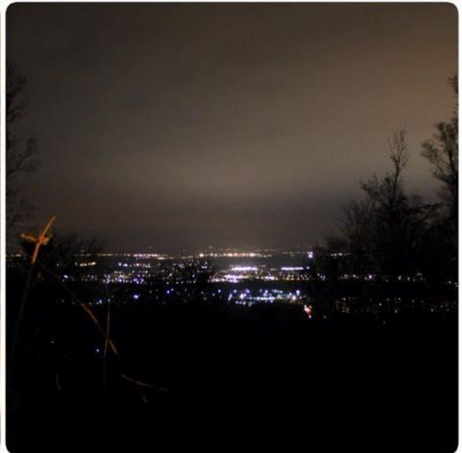
Some pictures from our on-the-job learning period in Germany