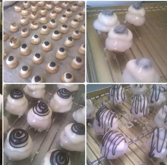
Our petit fours at Hoffman