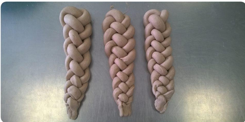
Some work we did at school. The mass in pictures is practice dough, it wasn't put in the oven and it wasn't edible. It was reusable.