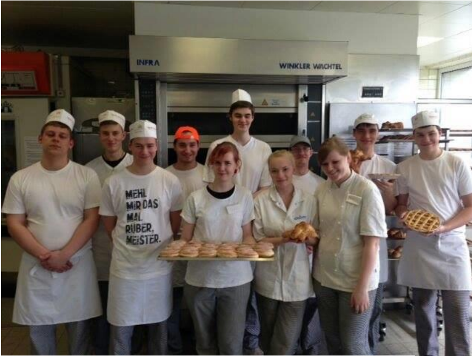
There was only one girl in the class (who doesn't appear in the picture), as baking is more of a male job in Germany.